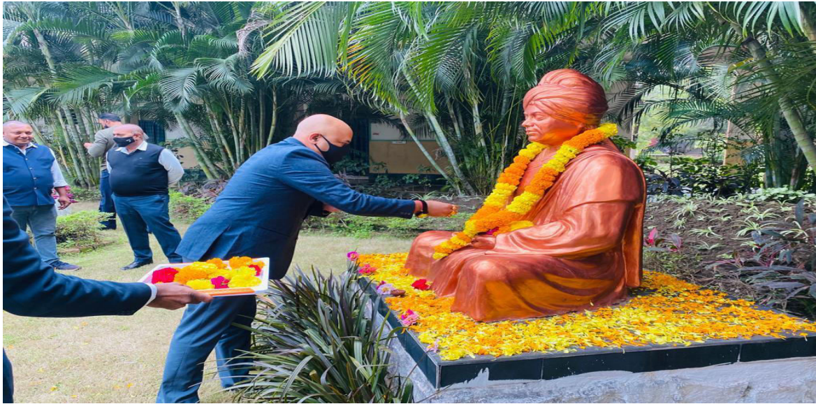
Chairman of CSIT, Durg tribute to Swami Vivekananda

1. National Youth Day (Swami Vivekanand Jayanti): - Every Year National Youth Day, also known as Vivekananda Jayanti, is celebrated on 12 January, being the birthday of a Hindu monk, Swami Vivekananda. On his Jayanti, the Chairman, Principal, and all staff of CSIT, Durg, honor Swami Vivekananda by offering floral tributes.