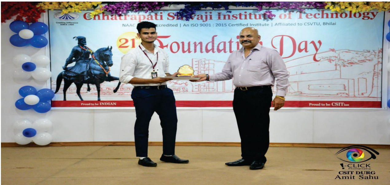
Chairman, CSIT, Durg Honoring the student on Foundation Day

6. Foundation Day: -September 6th marked a momentous occasion at CSIT Durg as the institute joyously celebrated its Foundation Day with a gathering of students, faculty members, and proud parents. The event shone a spotlight on the achievements of students, honoring their academic brilliance, extracurricular flair, and contributions to co-curricular activities. Additionally, faculty members were lauded for their commitment to academic excellence and groundbreaking research pursuits. It was a day filled with pride, camaraderie, and a shared vision for the continued success of CSIT Durg.