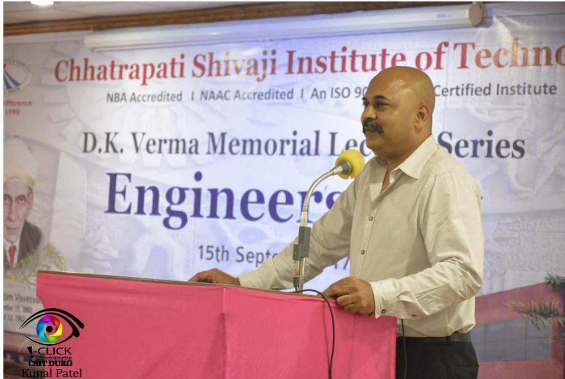
Chairman, CSIT, Durg addressing the gathering on Engineer's Day Celebration