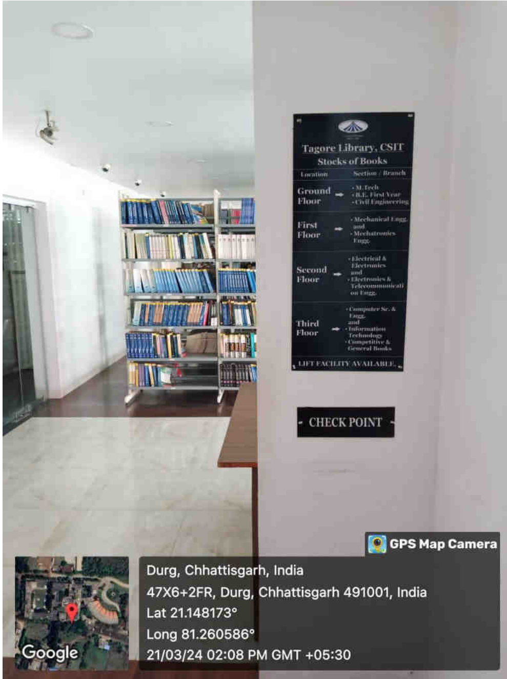
CENTRAL LIBRARY STACK SECTION ENTRANCE

Approved by: AICTE, New Delhi | Affiliated to CSVTU, Bhilai