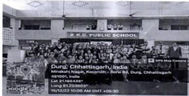
Fig. of Road Safety and Helmet Awareness Programme for the students of K.D.Public School, Borsi