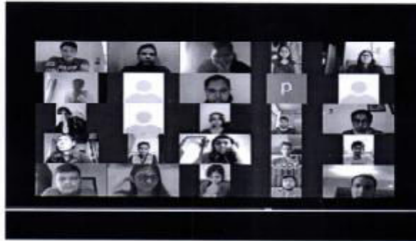
Fig. of online session on safety and security precautions on COVID-19