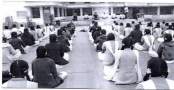
Fig. of One Day Yoga & Meditation Workshop for the students of Swami Atmanand H.S.English & Hindi Medium School, Risali-Bhilai