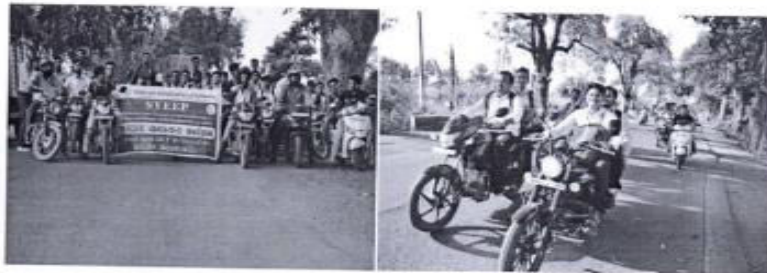
Fig. of Voters Awareness program (Rally ) in Durg