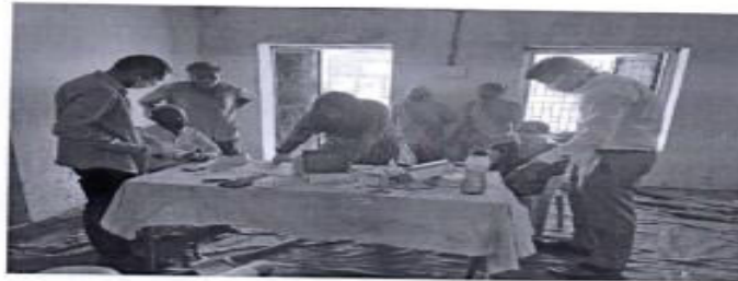
Fig. of One day Health Checkup Camp at at Thanaud village Durg