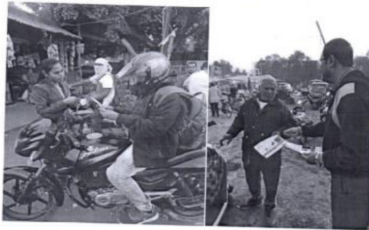
Fig. of Public Awareness on Road Safety and Helmet at Jail Chowk, Durg