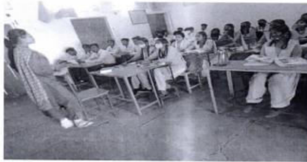
Fig. of Awareness Programme on Internet of Things (IOT) for the school students of Beacon Hs. School & Sarasvati Shisu Mandir, Korba