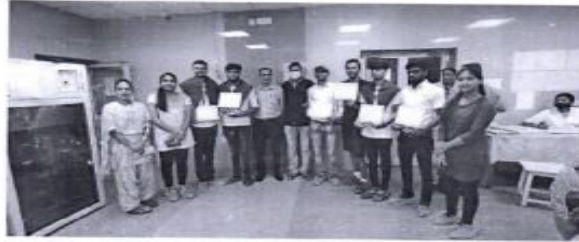
Fig. of Blood Donation Camp CSIT Durg