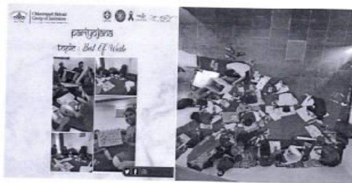
Fig. of Waste to Wow: Student Workshop on Creative Recycling