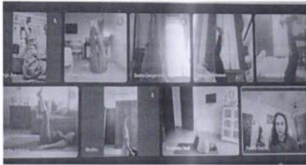
Fig. of Online Yoga and Meditation Drive