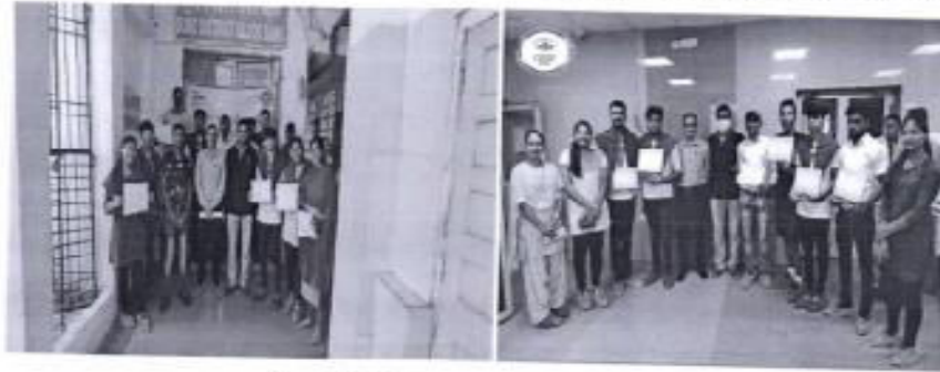
Fig. of Blood Donation Camp at CSIT Durg.