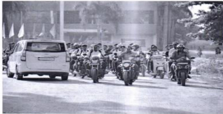
Fig. of Public Awareness activity 'Ballot Brilliance: Be Informed, Be Involved' under SVEEP for the Durg -Bhilai